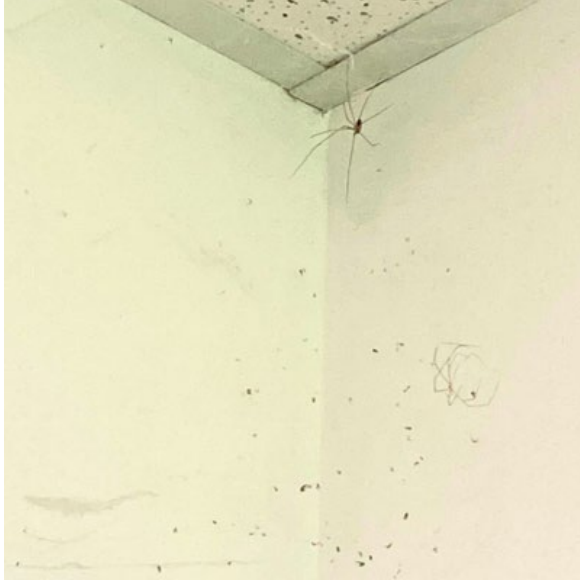
Photograph 5: Unclean Conditions.