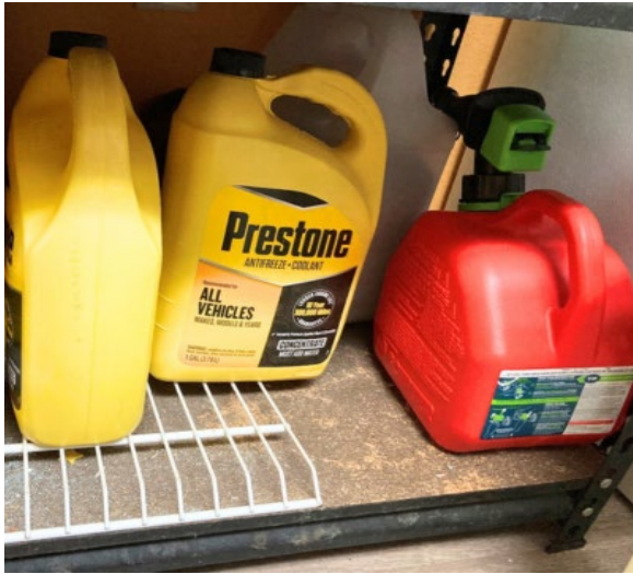
Photograph 1: Hazardous Chemicals.

Those findings included the following: toxic chemicals in unlocked areas that were accessible to participants in 11 facilities (Photograph 1); insufficient maintenance in 8 facilities (Photograph 2); water damage in 8 facilities, with mold in 1 of them (Photograph 3); exposed electrical wiring in 4 facilities (Photograph 4); unclean conditions in 3 facilities (Photograph 5); and alcoholic beverages in 1 facility (Photograph 6). (See Appendix E for additional photographs of noncompliance.)