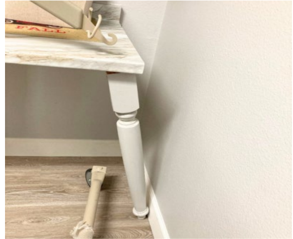
Photograph 14: Insufficient Maintenance.