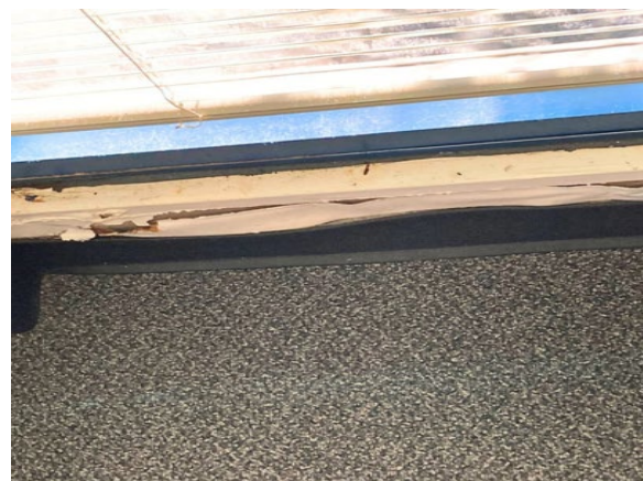
Photograph 18: Water Damage.