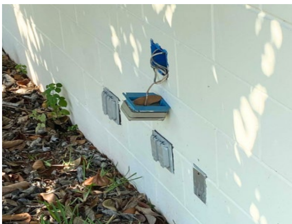
Photograph 17: Exposed Wiring.