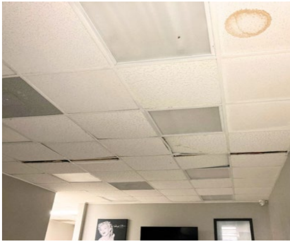
Photograph 15: Insufficient Maintenance.