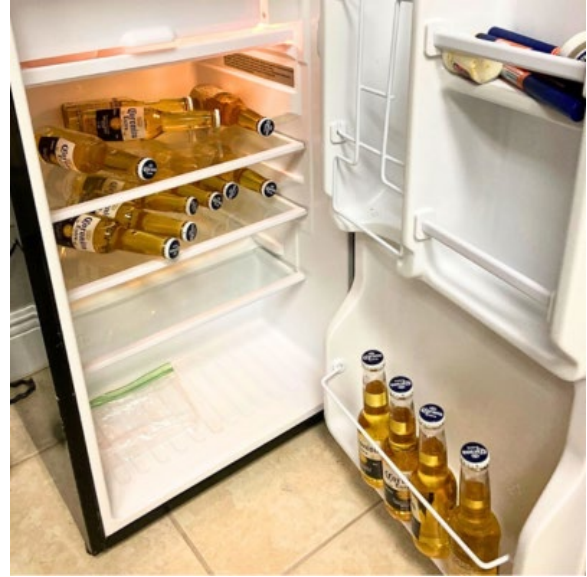
Photograph 6: Alcoholic Beverages.