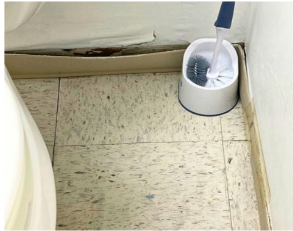
Photograph 16: Insufficient Maintenance.