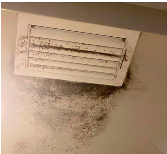
Photograph 3: Water Damage and Mold.