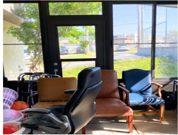
Photograph 8: Blocked Exit.