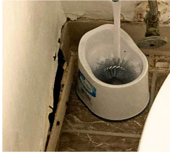
Photograph 2: Insufficient Building Maintenance.