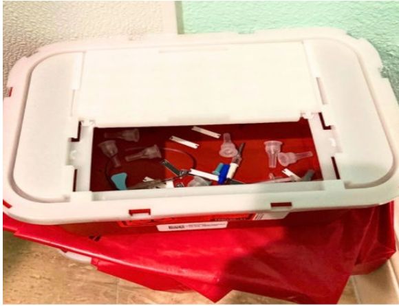
Photograph 7: Open Sharps Container.