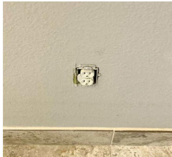
Photograph 4: Exposed Wiring.