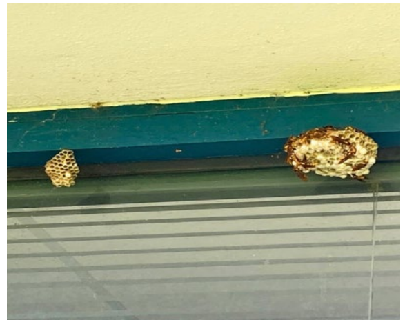
Photograph 10: Pests.