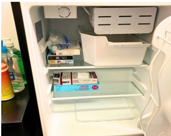
Photograph 11: Unlocked Medicine.