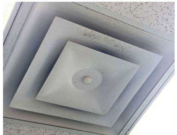
Photograph 12: Mold.