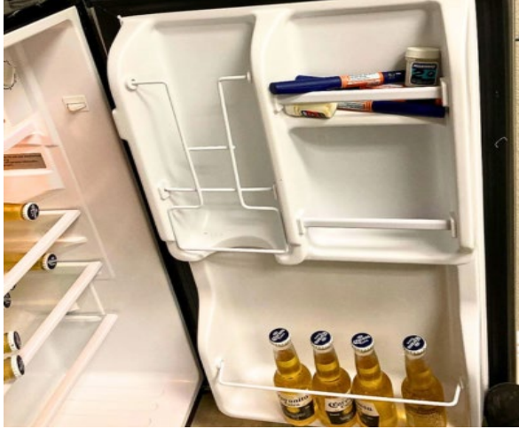
Photograph 13: Unlocked Medicine and Alcoholic Beverages.